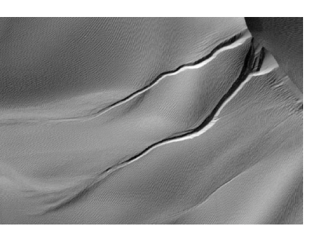
Image of two gullies on a sand dune taken by NASA's Mars Reconnaissance Orbiter. Gullies consist of a source 'alcove', transport 'channel', and lower 'fan deposit' and form when material is transported downhill (the dune ridge is at top right in this image). Scientists debate whether water, carbon dioxide, or dry material is responsible.