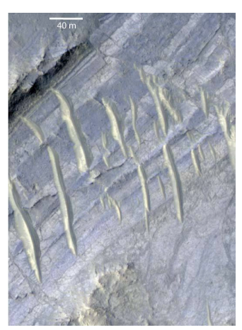
False color image of the interior of a Martian crater from NASA's Mars Reconnaissance Orbiter, showing exposed raised light-colored regions containing carbonates