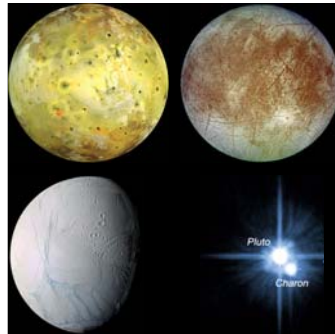
Clockwise from top left: Io, Europa, Pluto and Charon, and Enceladus. Tidal forces exerted on all of these objects have slowed their rotation rate over billions of years, so that they always keep the same face toward the object they circle.