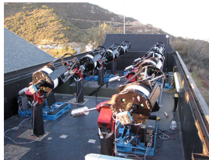
Eight 16" telescopes monitor a few thousand stars cooler than the Sun, searching for transiting planets as part of the M Earth project. Similar ground-based configurations may soon be able to detect Earth-sized planets.