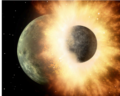
Artist rendition of two planets undergoing a catastrophic collision. Such collisions do happen in planetary systems, but are highly unlikely after the system has formed.