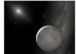
Artist's conception of dwarf planet Eris.