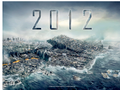
Movie poster for '2012', released in November 2009. The movie features worldwide tectonic activity and natural disasters, triggered by the Sun.