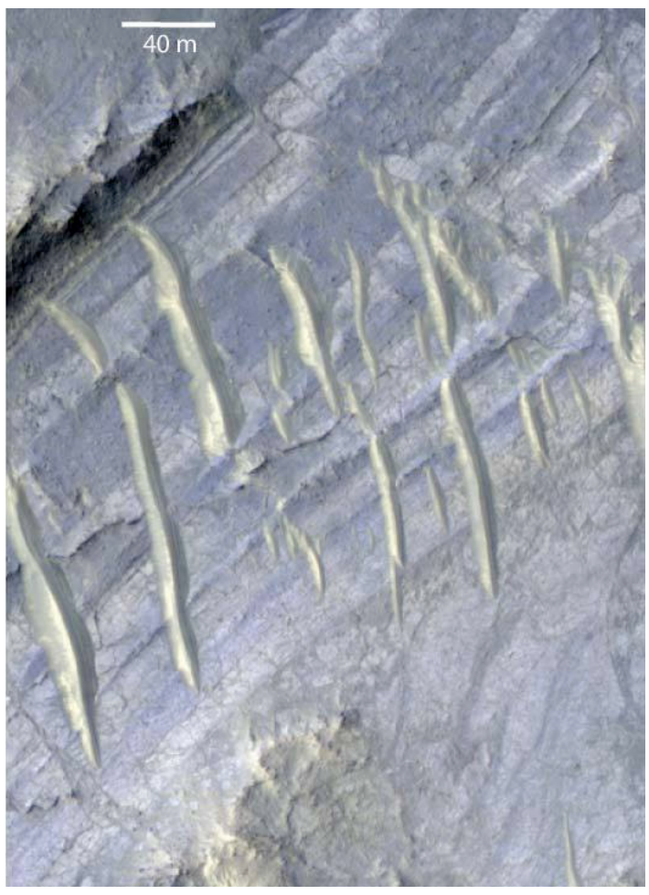
False color image of the interior of a Martian crater from NASA's Mars Reconnaissance Orbiter, showing exposed raised light-colored regions containing carbonates