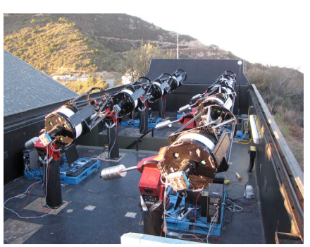
Eight 16" telescopes monitor a few thousand stars cooler than the Sun, searching for transiting planets as part of the MEarth project. Similar ground-based configurations may soon be able to detect Earth-sized planets.