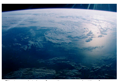
Photograph taken from the space shuttle of glinted sunlight from Earth's oceans.