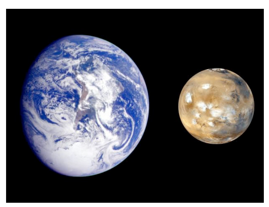
Sulfur gases may have affected the geology and climate of Mars enough to make it habitable in the past.